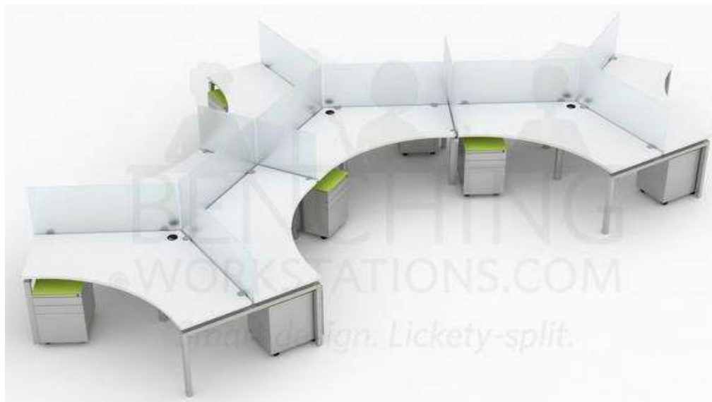
Shown in Electric White

Our 120 Degree Seating for 9 Bench Workstation Combo Ships for FREE in 5-Working Days.