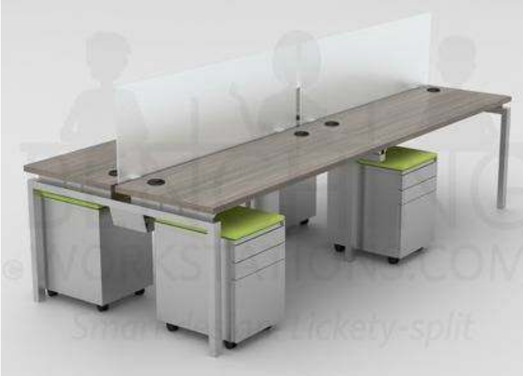
Shown in Shadow Elm

Pod Seats: 4 Workstation Surface: 72" x 24"