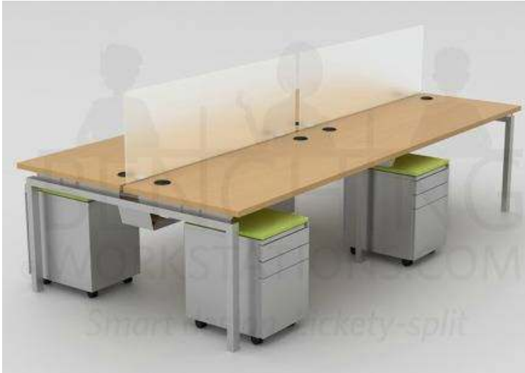
Shown in Sonic Maple

Pod Seats: 4 Workstation Surface: 60" x 30"