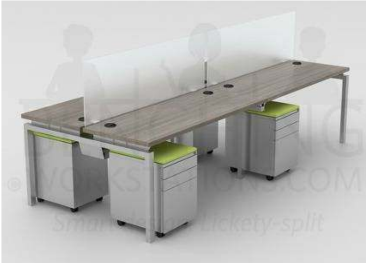
Shown in Shadow Elm

Pod Seats: 4 Workstation Surface: 60" x 24"