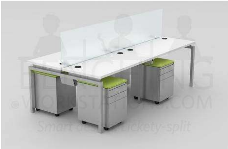
Shown in Electric White

Pod Seats: 4 Workstation Surface: 48" x 24"