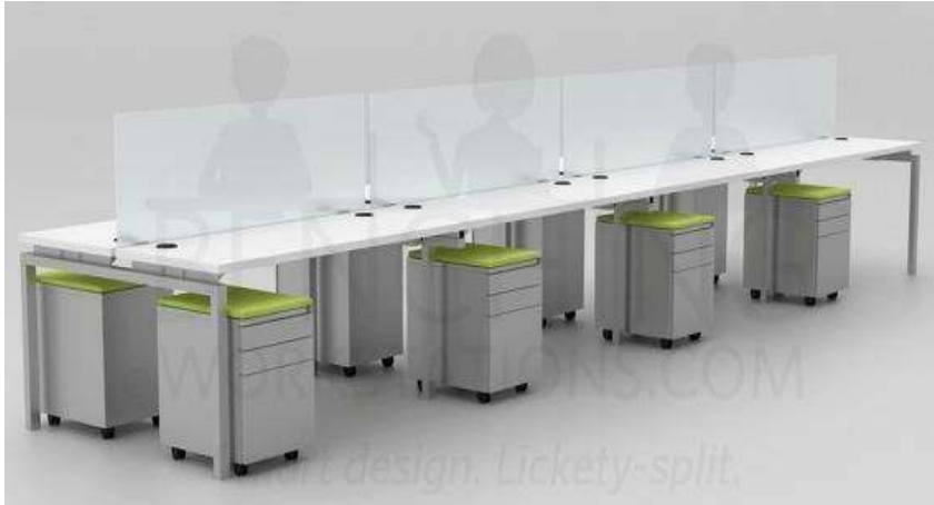
Shown in Electric White