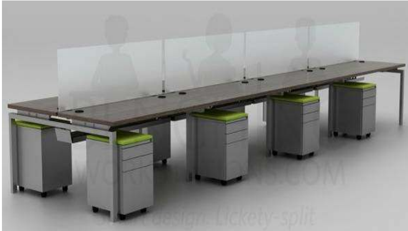
Shown in Shadow Elm