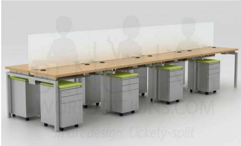
Shown in Sonic Maple