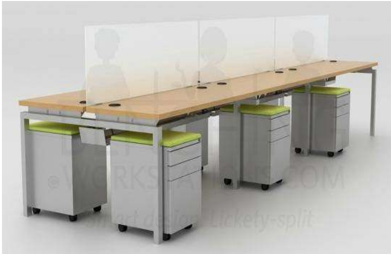
Shown in Sonic Maple