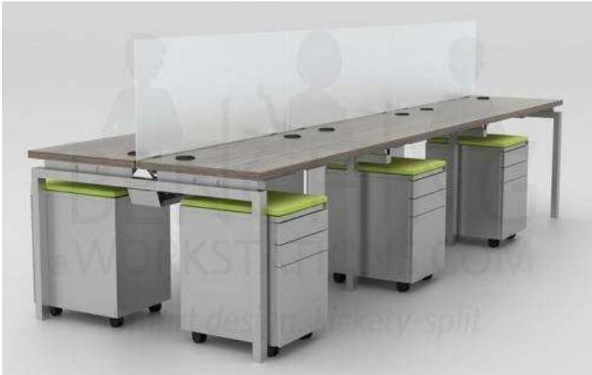
Shown in Shadow Elm