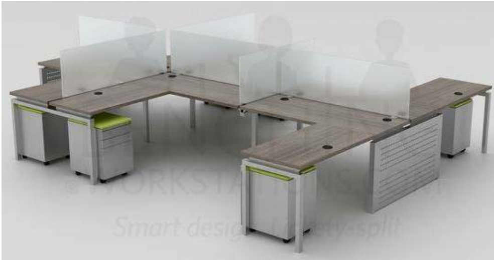
Shown in Shadow Elm

L-Shape Seating: 6 Workstation Surface: 60" x 24" with 42" x 24" Return Page 1 of 2