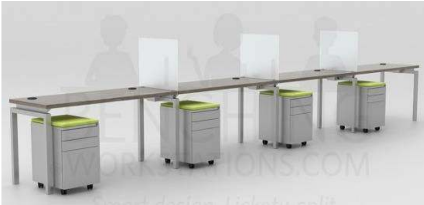
Shown in Shadow Elm