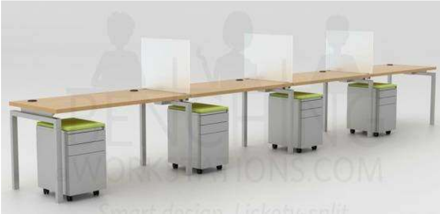
Shown in Sonic Maple