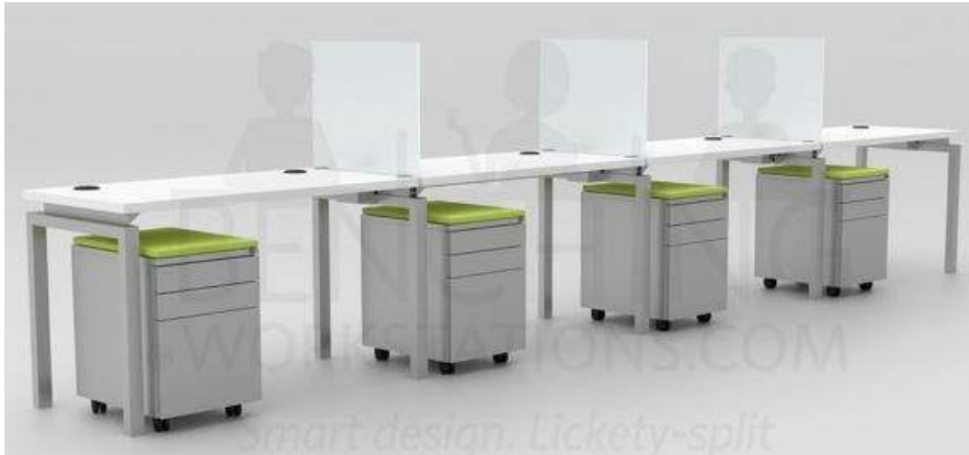
Shown in Electric White